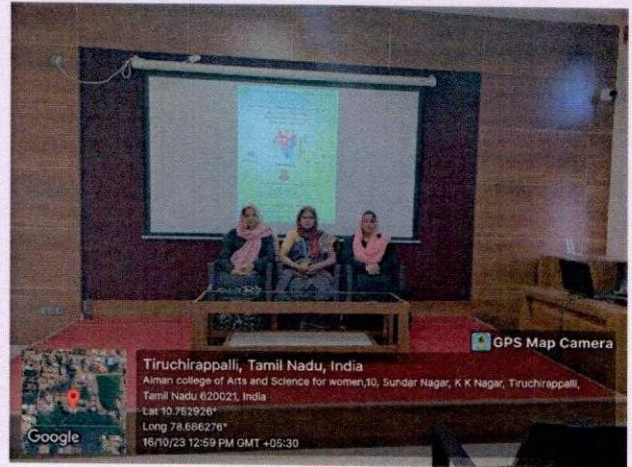
Meeting on “A Futuristic view of Young Nation” held at Seminar hall.