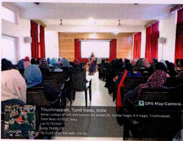
Students listening to the program